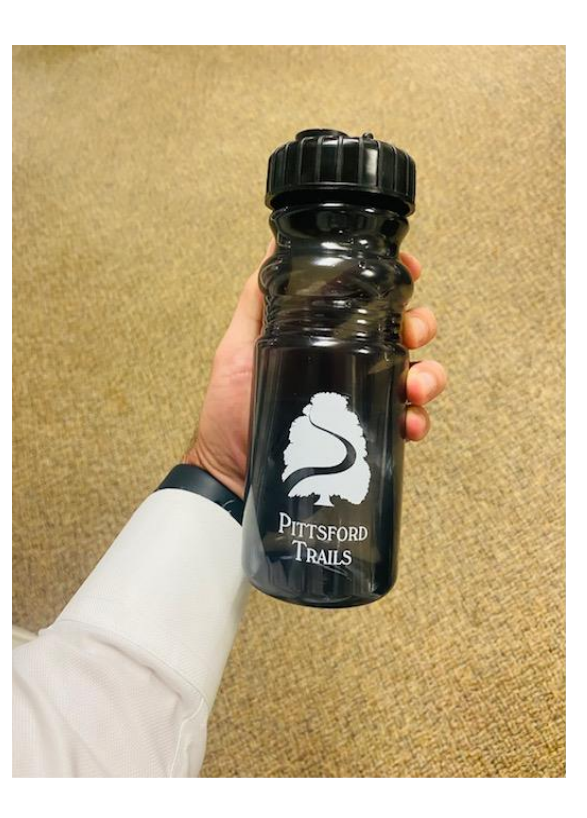
The Town gave out 500 free reusable water bottles filled with promotional fliers.

The Town received a Grant from the Erie Canalway National Heritage Corridor to purchase promotional materials in support of the Canalside Concert Series and the Town's new nature preserve and park. The Town purchased 500 reusable water bottles labeled with The Erie Canal's bicentennial period, 2017-2025. The water bottles were filled with promotional fliers for the Concert Series and the Town's new Erie Canal Nature Preserve.