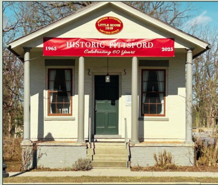
Celebrating 60 Years of historic preservation at the Little House!

www.historicpittsford.org/event-details/history-of-preservation-in-the-village .