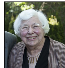
Jean France Historic Preservation Scholarship

Recent recipients listed on our website include seniors at both Pittsford High Schools and students at Nazareth and SUNY Brockport. Eligibility criteria and an application