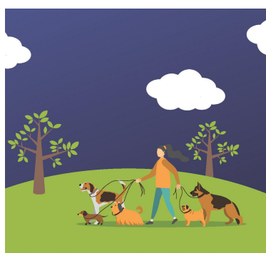
Enjoy with your dogs, but please keep our trails, sidwalks and parks clean.

Our parks, trails and sidewalks are meant for all to enjoy. Please – if you are out enjoying time with your dog be considerate of others and be sure to clean up after your pet. Leaving pet waste in parks and along sidewalks and trails is not only unsightly, it's unhealthy. It's also a violation of Town code, and can be punishable by a fine. Please be a responsible pet owner – clean up after your pet and dispose of pet waste appropriately, in your trash receptacle. It's the right thing to do. And it keeps our trails enjoyable for all to use.