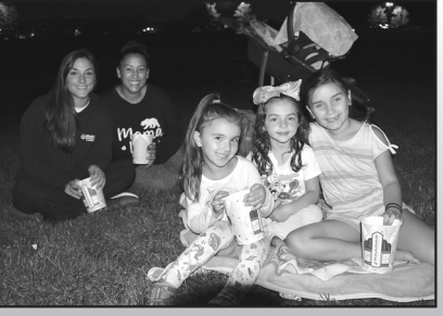
Our 2019 Summer Concert Series, Concerts for Kids and Family Outdoor Movie Nights were a big hit with kids and adults alike!