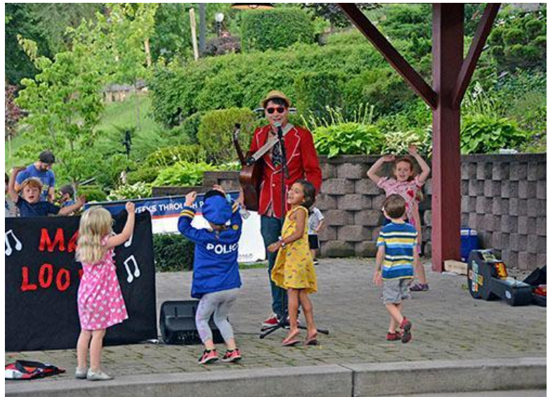
Concert for Kids tonight with Mr. Loops!

Join us at 6:30pm along the canal in Carpenter Park at the Port of Pittsford for this free evening of family entertainment. You'll love the music - and may even want to sing along! Carpenter Park is located at 22 North Main Street. Visit our Concerts for Kids web page for complete information.