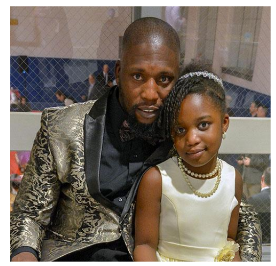
Our Sweetheart Dance is this Friday at the Spiegel Pittsford Community Center!

To <u>register online</u> click the link and see the "Family and Youth" section, or stop by the Spiegel Pittsford Community Center to register in person.