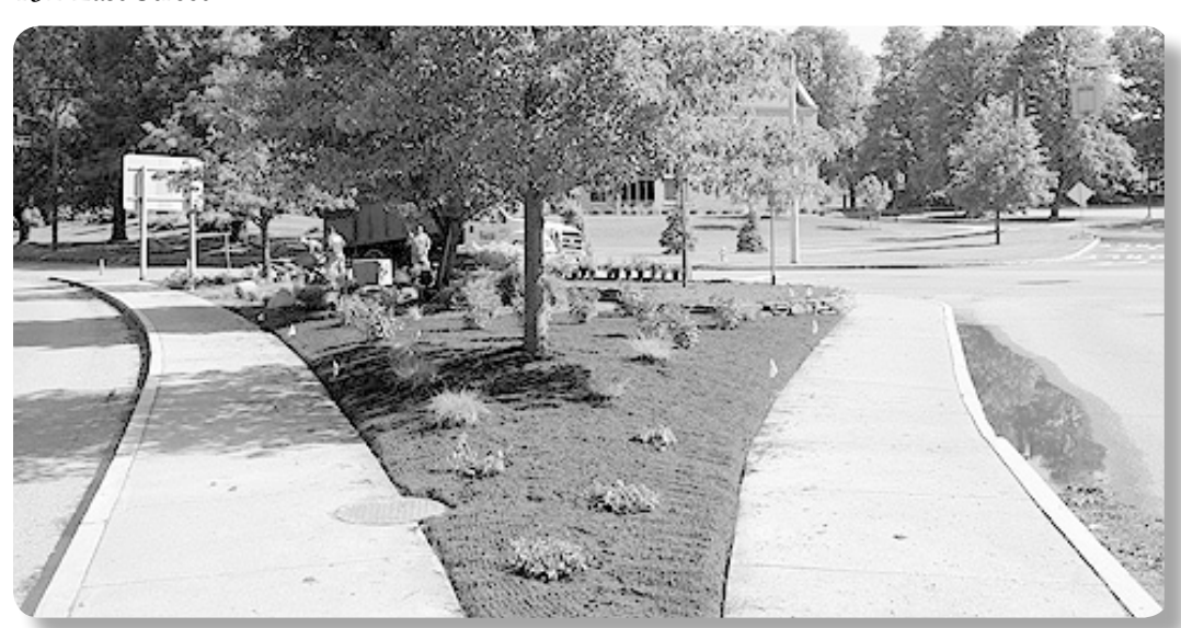
The Town of Pittsford and St. John Fisher College have joined forces to help beautify the intersection of East Avenue and Route 31. This area is an important gateway for the Town of Pittsford and the college. The island has been completely re-planted with rose bushes and other blooming perennials.