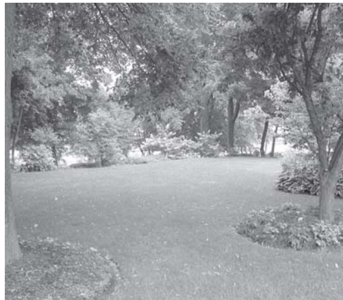
The upper level of the Port of Pittsford town park located in the village at 22 N. Main Street is the proposed site of a Veterans Memorial.

for the construction of the memorial are being explored and plans for the design of the area are being reviewed by the various stakeholders including the town, the American Legion and the Pittsford Garden Club. The project is moving forward with hopes of an autumn unveiling on the Veterans Day federal holiday, Friday, November 10.