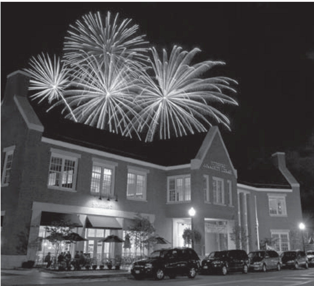
A day of celebration! The view from State Street on Saturday, September 17, as the town's annual fall festival "Pittsford Celebrates" and the grand opening of the new Pittsford Community Library culminated in a brilliant fireworks display.