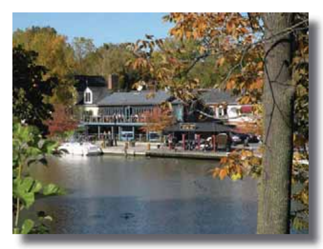
The Village of Pittsford is an important commercial and social center for Pittsford residents.

Municipal boundaries may distinguish the Town and Village of Pittsford from one another, but in the minds of most residents, the town and village constitute one community. Indeed, it is hard to envision the village, without the surrounding town and vice versa. The Village of Pittsford is a focal point of community life and activity for both village and town residents. The historic scale of the village and canal setting, the walkable environment, and a critical mass of activity – including the town library— all contribute to a sense of place that is difficult, if not impossible to create from scratch. In an age of dispersed, automobile-