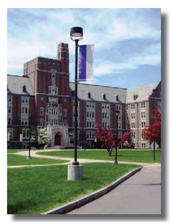
In 2008, Nazareth College's enrollment exceeded 3,000 students in both graduate and undergraduate programs.

The colleges, which each enroll approximately 3,000 full- and part-time students, lend Pittsford a college-town vibe. When the weather is pleasant, college students can be seen jogging along East Avenue and walking into the village to patronize the local stores. Both Nazareth and St. John Fisher are prospering and have made significant investments in campus facilities in recent years. For instance, the "Nazareth College Art Center," a premier regional venue for entertainment with an emphasis on dance, is currently being renovated to provide more seating and expand the range of performances that it can host. The colleges also provide a significant source of employment. According to the 2000 Census, over 300 town residents earn their living by teaching at the college level (see Table 6, Appendix B). It is likely that a sizeable portion of these individuals are teaching at Nazareth and St. John Fisher. Moreover, these employment numbers do not take into account the many non-teaching positions available at both colleges, such as administrative and facilities management positions.