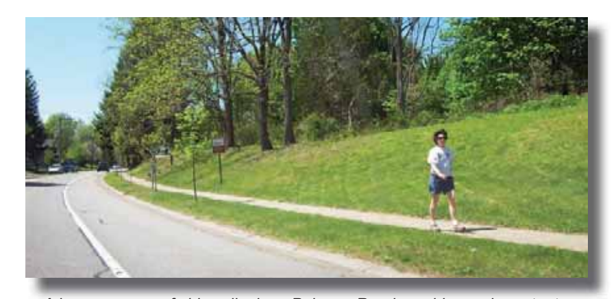
A long expanse of sidewalk along Palmyra Road provides an important connection to the village from surrounding neighborhoods.

Over the years, the Town of Pittsford has established a diverse system of parks, athletic fields, trails, sidewalks, and recreational programs. While this system continues to serve Pittsford residents, opportunities exist for improvement and expansion of parks and recreational programs to meet the growing and changing needs of town residents. As the town continues to improve its recreational infrastructure, it is important