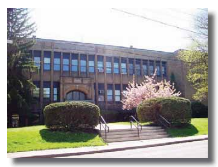
Located in the Village of Pittsford, the Recreation Center has many different spaces available for community use. The town also offers recreational programs, child care, and much more out of the Recreation Center.

Before any actions are taken, a better understanding of the types of recreational amenities desired by the community at large, as well as by specific youth, outdoor, and recreation groups is needed. The demand/needs for athletic facilities should also be identified and the town should continue to work collaboratively with the schools and athletic groups to fill needs. If there is a gap in the recreational needs of the town, various options should be explored for filling the needs. This might include expansion of the existing community center; the development of satellite recreation centers in different areas of town; or a new