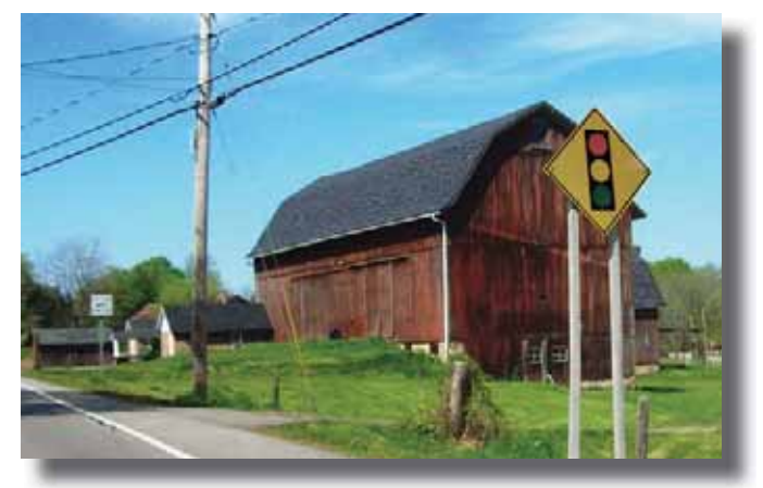
One of the many beautiful barns located throughout rural Pittsford.

The town's Greenprint effort would not have been possible without the hard work and commitment of the town, residents and farmers. Ultimately, it led to the permanent protection of over 1,200 acres of working farmland. To honor this effort, the town, residents and farmers should continue to work together to keep farms in the town viable and productive well into the future. This may involve flexibility for farmers to meet new and evolving farming practices and opportunities.