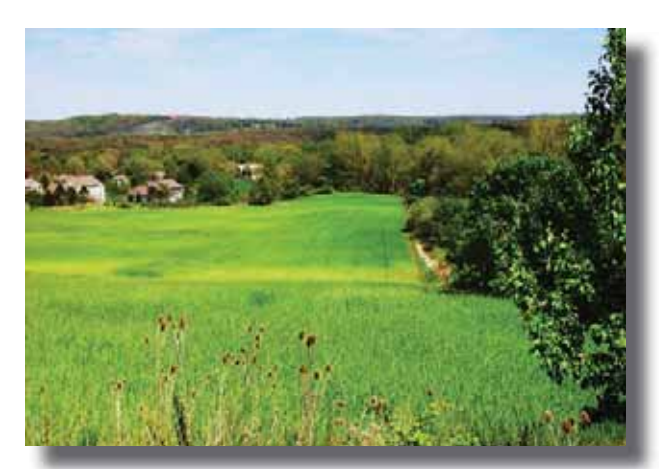
A product of the town's "50-50 zoning," this image shows a nice balance of residential development surrounded by open lands.

will continue to honor this achievement through the ongoing stewardship of open spaces, ensuring that their contribution to the town's quality of life is maintained and that they are utilized in a manner for which they were originally intended. Specifically, the town should clarify the type of open space lands that make up its portfolio and develop long-term policy goals and management plans for it, including strategies for ensuring that open space derived from the town's 50-50 zoning is maintained and preserved for the benefit of the town, but in a manner that is compatible with adjacent residential neighborhoods.