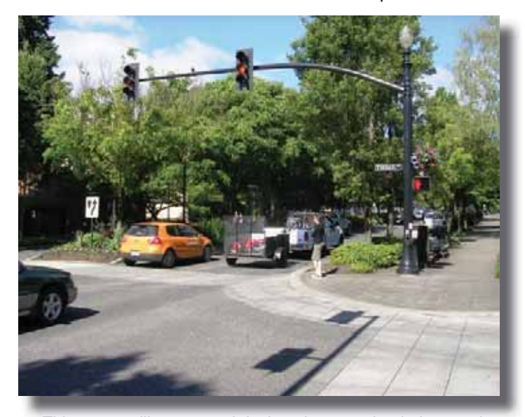
This street utilizes several design elements that help to make a safe place for both cars and pedestrians. Trees and planted medians help to enclose the street and encourage slow driving; curb bulb outs decrease the crossing distance for pedestrians; and clearly marked crosswalks alert drivers to stop for pedestrians.

A solid base of information on traffic levels and patterns across the town's transportation network is essential to helping the town maximize the safety and efficiency of the network. A fully informed town is also well positioned to advocate its point of view,