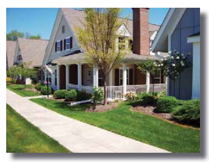
These attractive cottage homes add to Pittsford's housing diversity by providing a smaller-scale version of the single family home - offering less home and yard to maintain which is appealing to many different types of people.

the number of households in Pittsford has been growing, the average number of individuals belonging to a household (household size) is on the decline (see Appendix B ). This decrease in household size may be attributed to several factors, but is almost certainly influenced by the town's aging population and the typically smaller households associated with older individuals. In fact, between 1990 and 2000, residents 65 years and older were the fastest growing age-group in the town. In recognition of this, the town has over the years added multifamily and smaller patio-style homes to its portfolio of housing. As the town and its population continue to evolve,