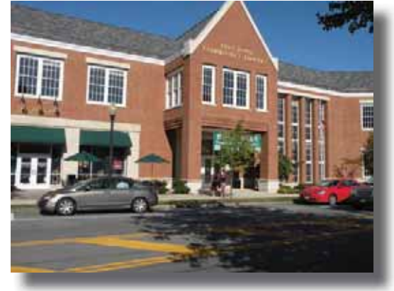
Pittsford's new library is located in the heart of the Village and serves as a centralized community space.

By the same token, the Town of Pittsford provides a lower density context that complements the village. Protected farms and open spaces reinforce a rural character outside the village, and a sensitive approach