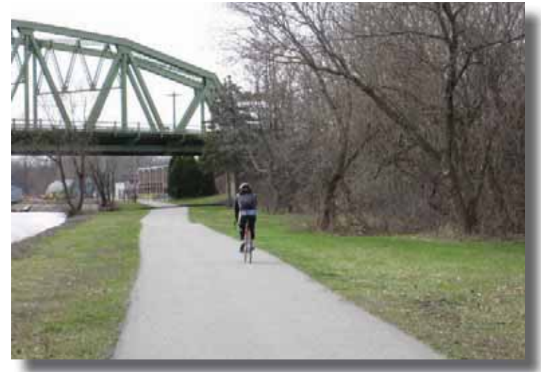
Expanded access to the Erie Canal Trail will allow more town residents to travel along this long-distance gem of a trail.

The Town of Pittsford has an extensive system of trails and parks. By promoting existing trails and parks, and making them more accessible, the town can ensure that its investment in these recreational resources and their contribution to the town's quality of life and health is maximized. Successful promotion of the town's trails and parks is attained when residents who wish to use them are fully informed of the range of possibilities. In an era where obesity is becoming an increasingly widespread health issue, particularly amongst young people, full