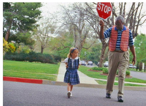
Volunteer Crossing Guards Needed

During the school year, RTS buses drop off and collect high schoolers and middle schoolers near the intersection of Sutherland Street and Monroe Avenue in the Village. With the volume of traffic there, especially in the afternoon when school lets out, it's a dangerous intersection to cross. The Town and Village plan to employ a crossing guard there soon.