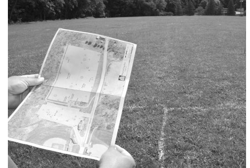
Plans for our new dog park include play structures, water fountains, benches, shade trees and picnic tables.

the Town will provide information about registration and other details. The Town remains interested in partnering with the Village of Pittsford for an additional dog park on Village-owned land by the Canal, should the Village decide to move forward with such a project.