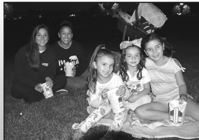
Our 2019 Summer Concert Series, Concerts for Kids and Family Outdoor Movie Nights were a big hit with kids and adults alike!