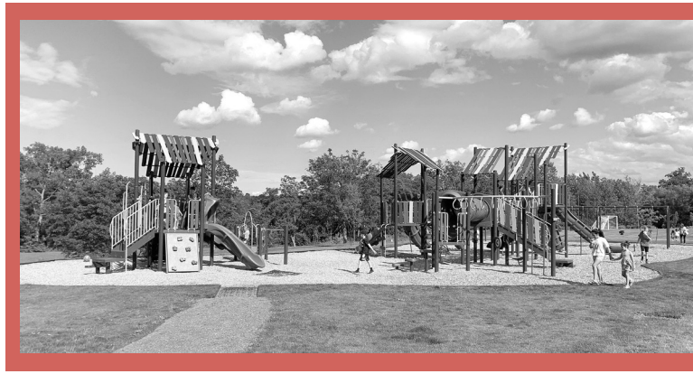
Healthy outdoor fun for families — our newest playground at Great Embankment Park, nestled along the Erie Canal.