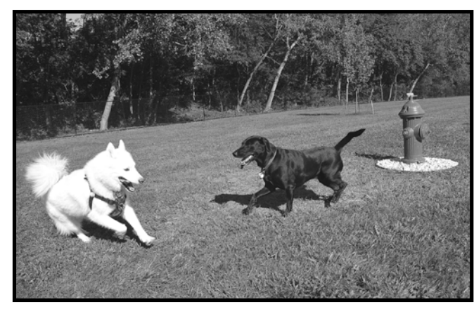
Plenty of safe room to run at the Pittsford Dog Park.

Our Dog Park is part of the Monroe County Dog Park system; dogs must be registered with the County to participate in the Dog Park system. Find registration information on the County website at www. monroecounty.gov/parks-DogParks . The Pittsford Town Dog Park is open year-round from 7:00am until dusk.